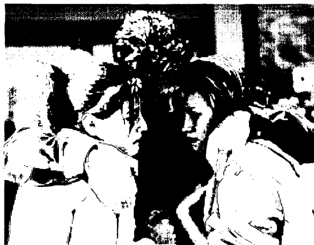
TWO SISTERS ARE COMFORTED BY THEIR FATHER AFTER A SCHOOL SHOOTING THAT LEFT TWO STUDENTS DEAD AT SANTANA HIGH SCHOOL IN SANTEE, CALIFORNIA.

As the study published in the April 25 JAMA points out, both perpetrators and victims of bullying risk long-term harm that can interfere with healthy psychosocial development. Youth who bully others tend to demonstrate higher levels of conduct problems, use of alcohol, and dislike of school. Youth who are bullied are at greater risk of anxiety, depression, loneliness, unhappiness, and low self-esteem, according to earlier research summarized in the JAMA study. And youth who report being on both ends of bullying—as both perpetrator and target—face especially high risks for problem behaviors and poor adjustment. Although the survey shows that bullying tends to decline as students get older, the damage can extend into adulthood. The JAMA study