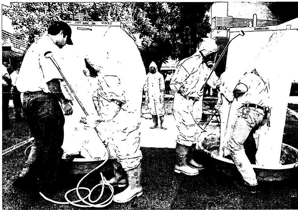
UCLA HAZMAT RESPONSE UNIT MEMBERS, DRESSED IN PROTECTIVE GEAR, WALK FICTITIOUSLY CONTAMINATED UCLA WORKERS INTO A DECONTAMINATION SHOWER OUTSIDE THE UCLA MEDICAL CENTER IN LOS ANGELES. THE DRILL, CONDUCTED IN NOVEMBER, IS PART OF THE COUNTY'S BIOTERRORISM PREPAREDNESS EXERCISE.