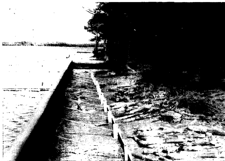
The proper design and construction of a bulkhead include the use of tiebacks and filter cloth.

Fish and wildlife resources generally receive the most severe impacts from construction activities because the two are seldom compatible. The loss of wetlands and subaqueous habitats are usually of the greatest concern. These areas provide much of the primary production which supports aquatic food webs. They are also the pri-