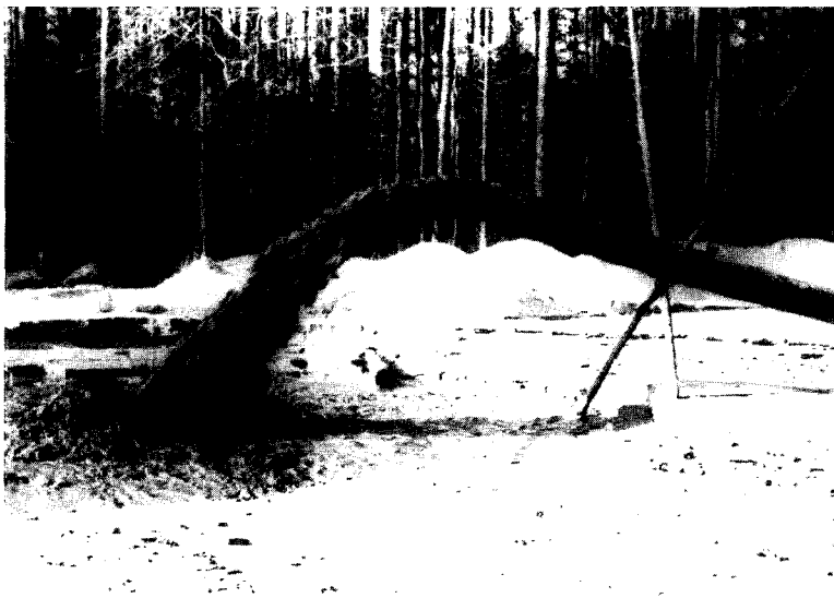
The proper design and construction of dredged material placement areas can avoid many environmental impacts.

In making these decisions, extenuating circumstances or any other relevant information either pro or con not mentioned in the above