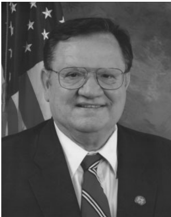
The Honorable Paul E. Gillmor