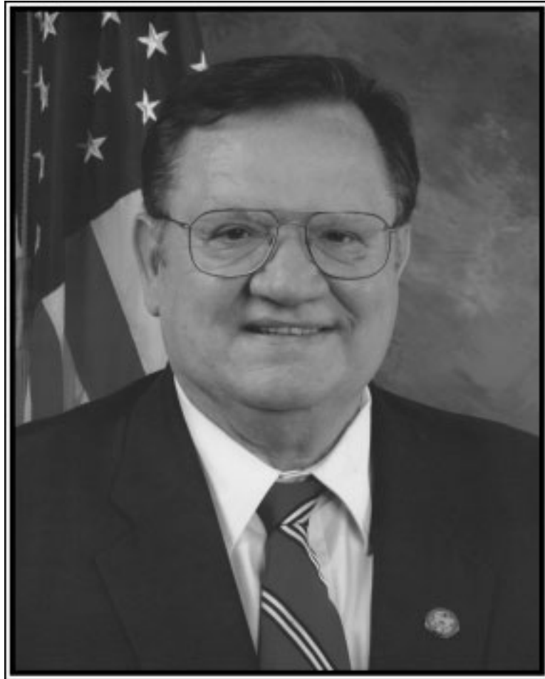
Paul E. Gillmor