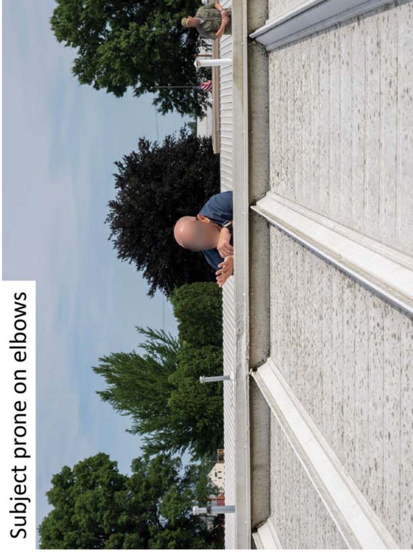
Subject prone on elbows