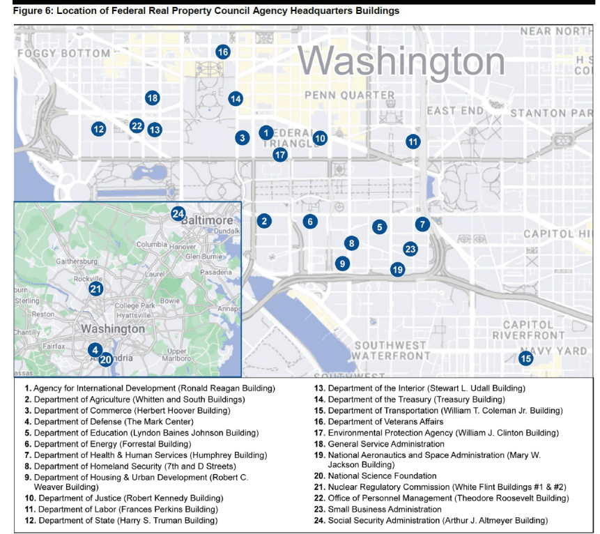
Appendix I: The 24 Agency Headquarters Buildings

Sources: Google Maps and GAO. GAO-23-106200