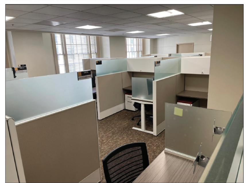
Figure 5: Shared Workstations within the U.S. Department of Agriculture

Eight agency officials also ranked inner-agency silos as the first or second biggest challenge to increasing headquarters utilization. For example, the Department of Energy noted that groups of seats in its headquarters are assigned to departmental elements based on their funding, customers, and workspace needs. Some agency officials said that individual bureau leadership protected spaces assigned to them, including offices, conference rooms, and specialized spaces like secure rooms. They said no current mechanism exists to share those spaces more broadly throughout their agencies. During our site visits, we observed building spaces subdivided into smaller bureau-level divisions that can lead to inefficient utilization. For example, USDA showed us a segment of their headquarters used for agency-wide workspace sharing, while the workspaces in the rest of the two buildings were assigned to individual bureaus (see fig. 5).