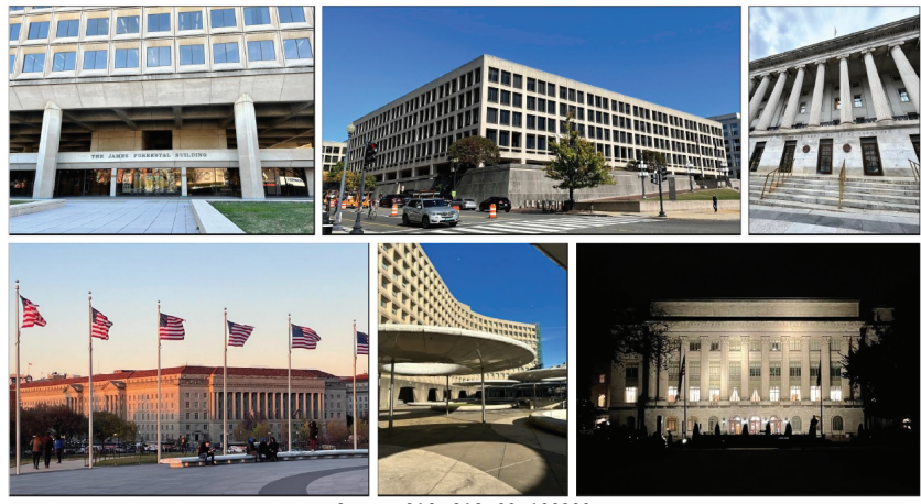
Figure 1: The Headquarters Buildings for the Departments of Energy, Labor, Treasury (first row), Commerce, Housing and Urban Development, and Agriculture (second row)

The federal government owns about 511 million square feet of office space, according to the Federal Real Property Profile—the government wide real property database maintained by the General Services Administration (GSA). GSA manages approximately 1,500 federally-owned buildings, which are used by various federal agencies (see figure 1). GSA also leases space for tenant agencies from private-sector owners. As of April 2023, GSA managed 7,685 leases, totaling nearly 180 million square feet of space.