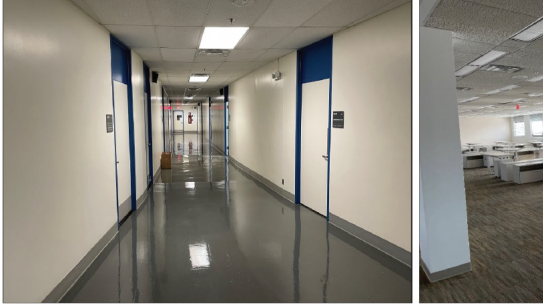
Figure 4: Office Space at the U.S. Housing and Urban Development Headquarters — Un-Renovated (left), and Updated (right)

Agency officials ranked the need for additional budget resources to reconfigure their spaces to support a hybrid office as the top challenge to increasing utilization of their headquarters building. Specifically, they said they would need to transform traditional office configurations into hybrid offices, allowing for more efficient use and better support of office sharing. For example, USDA officials said that updating their two-building headquarters to support higher density and office sharing would require millions of dollars of investments. In addition, some headquarters buildings are only partially updated. For example, Department of Housing and Urban Development officials said the agency made capital investments to update one wing to support modern, hybrid work (figure 4). However, the rest of the building has an outdated hallway-office configuration that does not support collaboration and shared spaces.