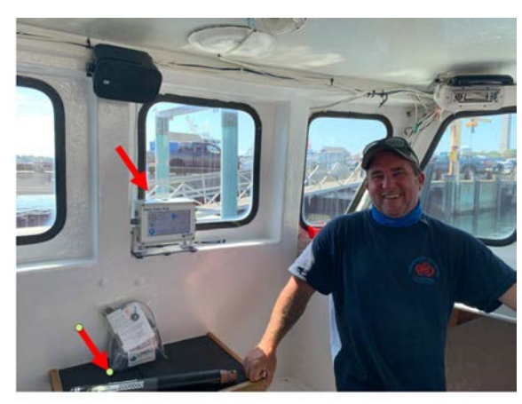
Figure 4. Dissolved oxygen sensor (lower red arrow) and deck display (upper red arrow) being used by New England lobstermen to track the onset of hypoxia on the East Coast

Innovations also take the form of new ideas. At OSU, researchers are working to stimulate a new marine climate insurance industry that would help seafood growers and harvesters be more climate-resilient. On land, farmers have access to insurance products to safeguard their livelihoods against drought and weather events. For fishermen dealing with increasing marine heatwaves or hypoxia, that's not an option. This is due in part to a lack of access to scientific information, such as the frequency and severity of events that would allow insurers to adequately price risk. Some of this information is already in hand and some will require further research, but this is the kind of blue economy opportunity that NOAA's vision for climate products and services can catalyze. Importantly, a marine climate insurance industry would give seafood growers and harvesters a tool to adapt to the uncertainties that continued climate change will bring.