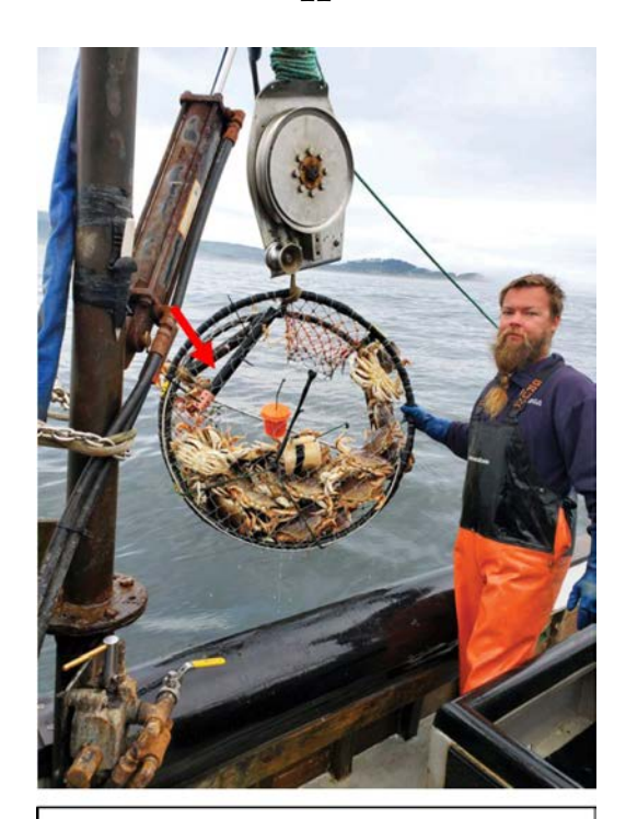
Figure 3. Commercial crabber bringing on deck a crab pot equipped with a smart dissolved oxygen sensor (red arrow) developed with support from NOAA NCCOS' Coastal Hypoxia Research Program.

The examples that I've shared came about from wise federal investments in innovations and partnerships. We have an opportunity to go much farther. In CIMERS, OSU and NOAA scientists are working on the intersection between new ocean acoustic technologies and artificial intelligence. The sounds captured by NOAA's Ocean Noise Reference Network (https://www.pmel.noaa.gov/acoustics/noaanpsocean-noise-reference-station-network) have varied uses including tracking climate change impacts on sea ice, monitoring the impacts of renewable energy projects, and delineating crucial habitats for marine mammals. By developing new acoustic technologies, including the use of autonomous underwater vehicles and new ways to automate analyses through artificial intelligence, ocean sound monitoring has the potential to cost-effectively provide the information needed to guide the management of multiple ocean priorities such as fishing, marine renewable energy, and protection of marine life.