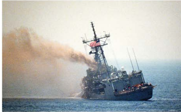
The guided missile frigate USS Stark (FFG-31) lists to port after being hit by two Iraqi Exocet missiles within 30 seconds in May 1987. Thirty-seven U.S. sailors were killed during this unrecognized war period.