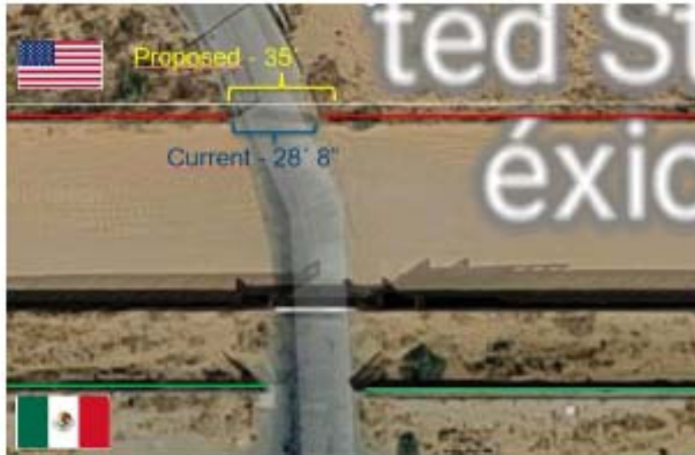
Figure 1. Santa Teresa Port of Entry

b. Immediately after entering the U.S. premises, which is currently the only pathway for oversized loads, the cargo lane curves to the left, forcing the Blade tip to swing out and hit the fence. (Fig. 2)