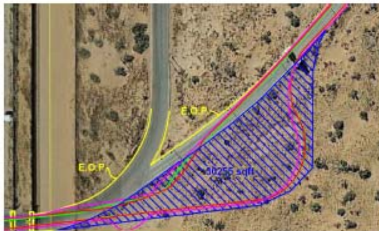
Figure 2. Curved lane. — Tip Swing. — Truck Front Axle. — Back Axle

b. Immediately after entering the U.S. premises, which is currently the only pathway for oversized loads, the cargo lane curves to the left, forcing the Blade tip to swing out and hit the fence. (Fig. 2)