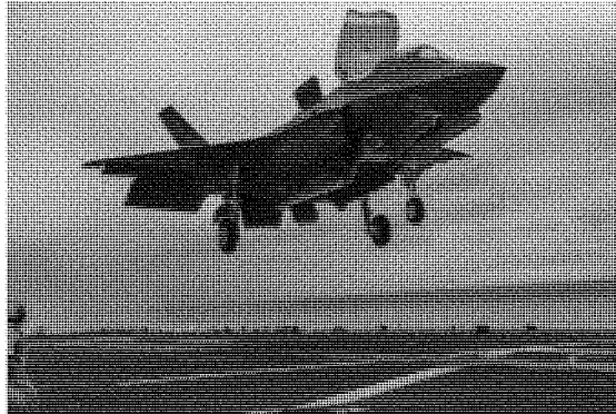
Figure 1: U.S. Marine Corps F-35B Conducting Training aboard the U.S.S. America

GAO-20-234T