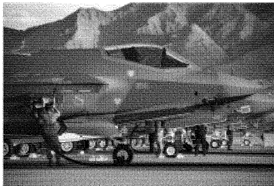
Figure 3: Refueling of an F-35A

Source: U.S. Air Force photo by R. Nial Bradshaw. | GAO-20-234T