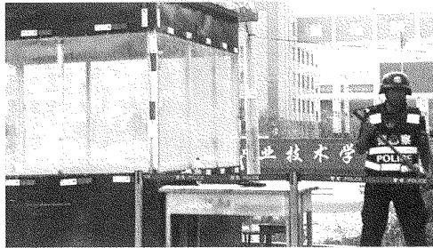
A guard stands outside what is officially known as a "vocational skills education center" in Hotan in Xinjiang in September 2018.