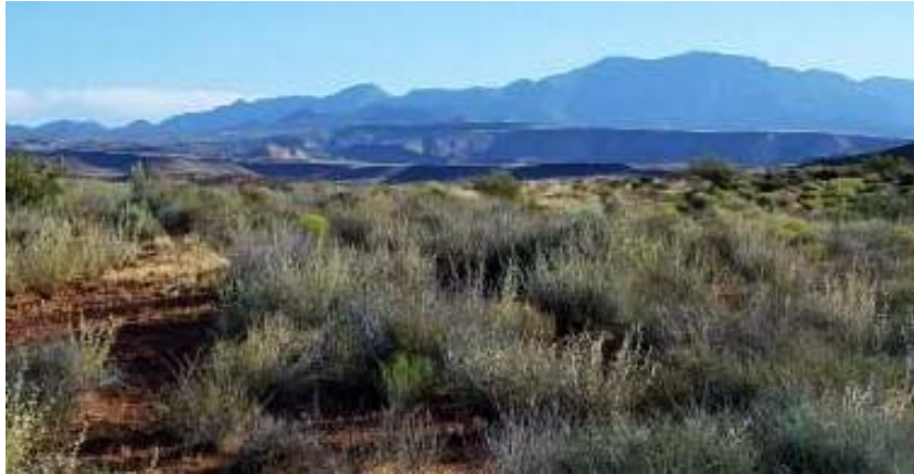
The Red Cliffs Desert Reserve/National Conservation Area Looking at the area where the proposed Northern Corridor Highway would be built, through the prime habitat of the Mojave Desert tortoise, taken from the existing highway through the habitat, the Red Cliffs Parkway.

The public lands in Washington County contribute to our quality of life, providing areas for world class outdoor recreation, protecting water quality and clean air as well as providing wildlife habitat. CSU works to ensure the irreplaceable cultural, scenic, ecological and scientific values are protected and properly conserved. We hope that county, state and national leaders will work with us, too.