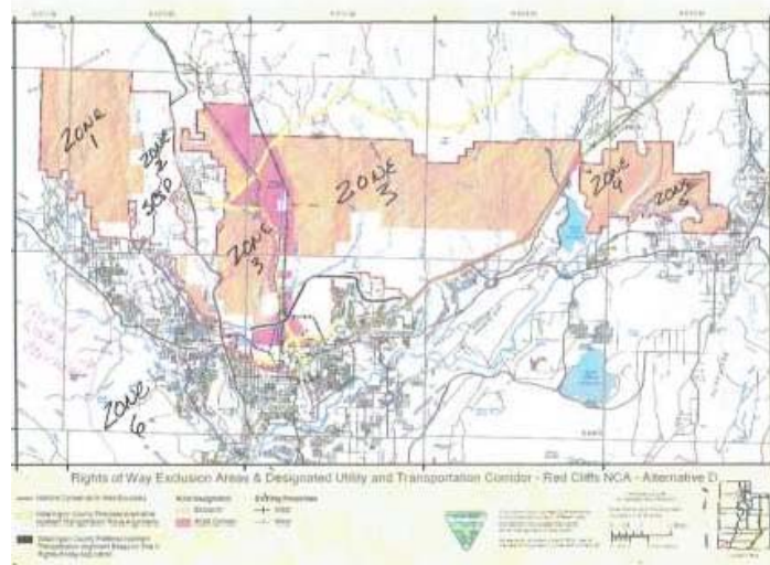
Best map available to us, showing the 6 zones and the proposed highway (black line in middle).

Ref: This issue pertains to the bill's section 3a (which requires applicable laws to be followed, which state, in essence, that a highway is not allowed), b and c (which state that the NCA is to be managed to enhance the habitat, which a highway does not do), and section 5 (which directs the highway to be allowed).