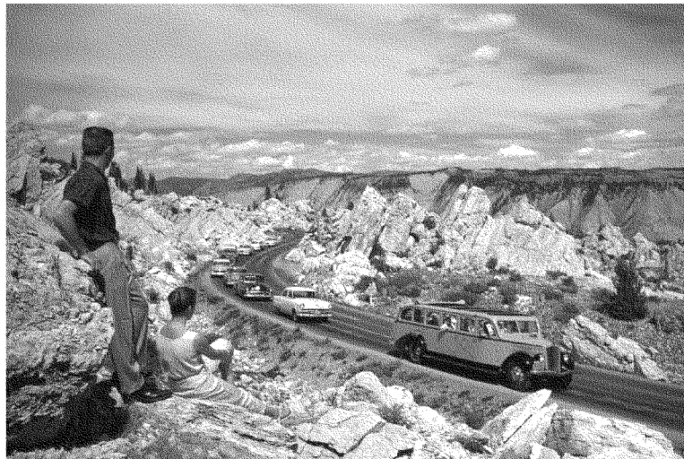
A line of cars winds through Yellowstone National Park in 1966. To Stephen Mather, first director of the National Park Service, cars were "the open sesame" to get people into the parks.

Getting people to the parks was the mission a century ago. Now it's putting visitors to work in the name of science.