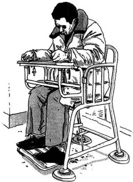
Illustration of a suspect restrained in what the police call an “interrogation chair,” but commonly known as a “tiger chair.” Former detainees and

The 145-page report, “Tiger Chairs and Cell Bosses: Police Torture of Criminal Suspects in China.” is based on Human Rights Watch analysis of hundreds of newly published court verdicts from across the country and interviews with 48 recent detainees, family members, lawyers, and former officials. Human Rights Watch found that police torture and ill-treatment of suspects in pretrial detention in China remains a serious problem. Among the findings are that detainees have been forced to spend days shackled to “tiger chairs,” hung by the wrists, and treated abusively by “cell bosses” – fellow detainees