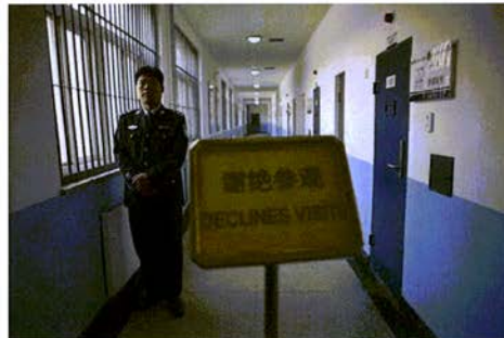
A police officer guards a corridor that is forbidden for visiting journalists to see during a government-organized tour of the Number One Detention Center in Beijing, Oct. 25, 2012.