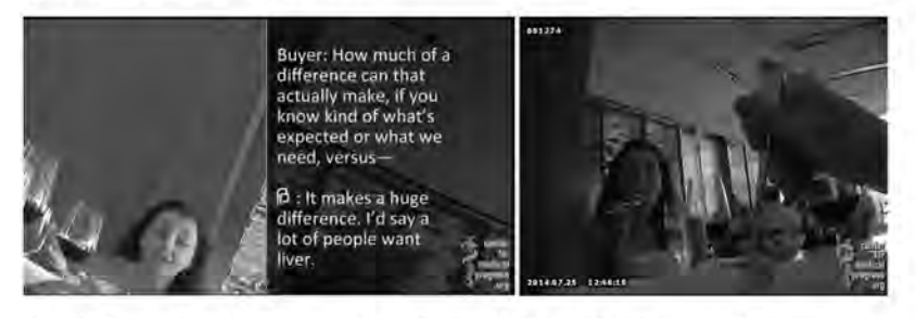
Left: California 2014 short video at running time 00:03:02. Right: Same shalog in California 2015 "juil justing" rideo (at 00:29:05)