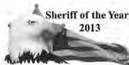
Sheriff of the Year 2013 Constitutional Sheriffs and Peace Officers Association