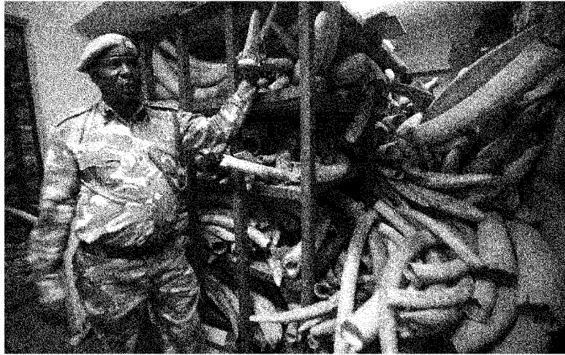
A Kenya Wildlife Services ranger shows elephant tusks intercepted from poachers during a commemoration of the 1989 ivory burning at the Nairobi National Park on July 18, 2009.