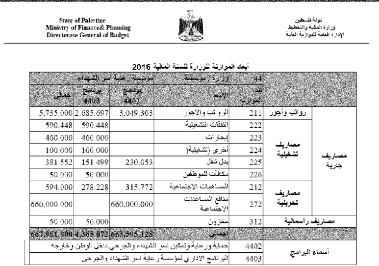
Fig. 3: Budget of the Institute for Care for the Families of Martyrs for 2016 (in NIS) 17