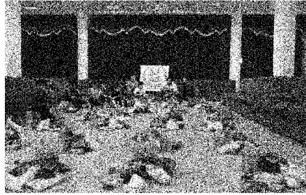
Figure 1.HHRG Humanitarian relief with the aid of CSI.