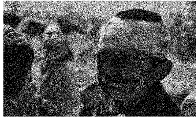
Figure 4 Yazidi children injured by ISIS attack.