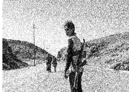
Figure 6 Yazidi woman defending her children in Sinjar.

ISIS have set up prisons in every city and town and village it controls. There are more than 500 Christian and Yazidi women being held, as well as Shabak women, and their fate is unknown.