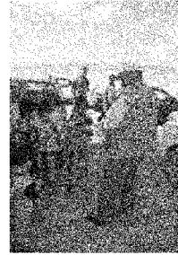
Figure 3 HHRQ distributing aid to Assyrians and Yazidis.