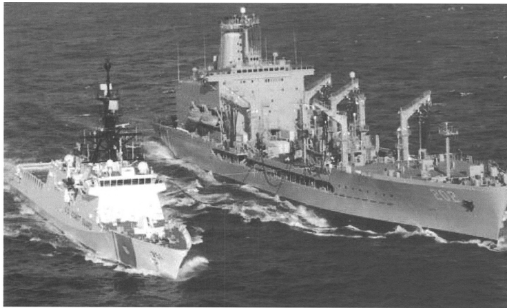
The Coast Guard Cutter WAESCHE conducts at-sea refueling operations for the first time in the ship's history.

The Coast Guard continues to focus resources on recapitalizing cutters, boats, aircraft, and Command, Control, Communications, Computers, Intelligence, Surveillance, and Reconnaissance systems, critical to sustaining the ability to accomplish missions well into the future. This budget request fully funds the sixth National Security Cutter, strengthening the Coast Guard's long-term major cutter recapitalization effort to replace its aged, obsolete High Endurance Cutter fleet as quickly as possible. The FY 2013 investments are critical to replacing and sustaining aging in-service assets, and are key to maintaining future capability.