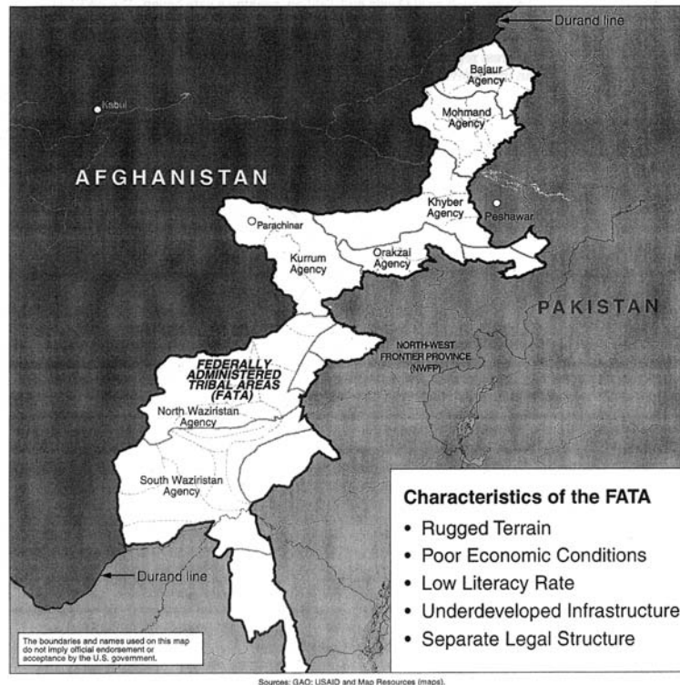
Figure 1: Map of the Federally Administered Tribal Areas, Pakistan

The FATA is governed by an administrative system and a judicial system different from the rest of Pakistan—the Frontier Crimes Regulation (FCR) of 1901, codified under British rule. 9 Because Pakistan retained the colonial administrative and legal structures of the British, as codified in the FCR, the FATA populations are legally separate from and unequal to other Pakistani citizens. Examples of these differences under the FCR include: