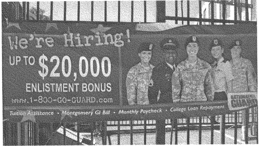
(This picture was taken outside the DC Armory on July 12,

The GI Bill is the military's single most effective recruitment tool; the number one