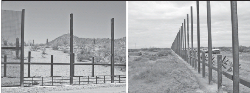
Figure 3: Examples of SBI Fence Construction