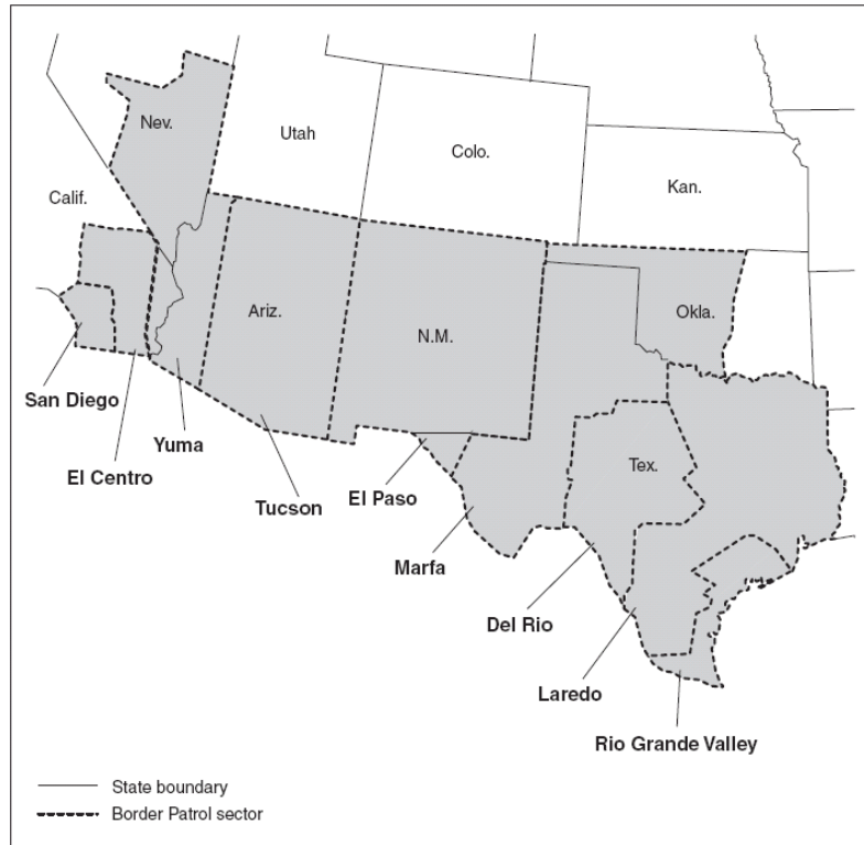
Figure 1: Map of Border Patrol Sectors along the Southwest Border

ports of entry 13 that CBP has designated as having the highest need for enhanced border security because of serious vulnerabilities. The SBI program office and its offices of SBInet and tactical infrastructure are responsible for overall program implementation and oversight.