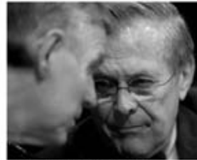
Defense Secretary Donald Rumsfeld (with General Richard Myers) before questioning by the Senate about the Abu Ghraib abuses, May 2004.