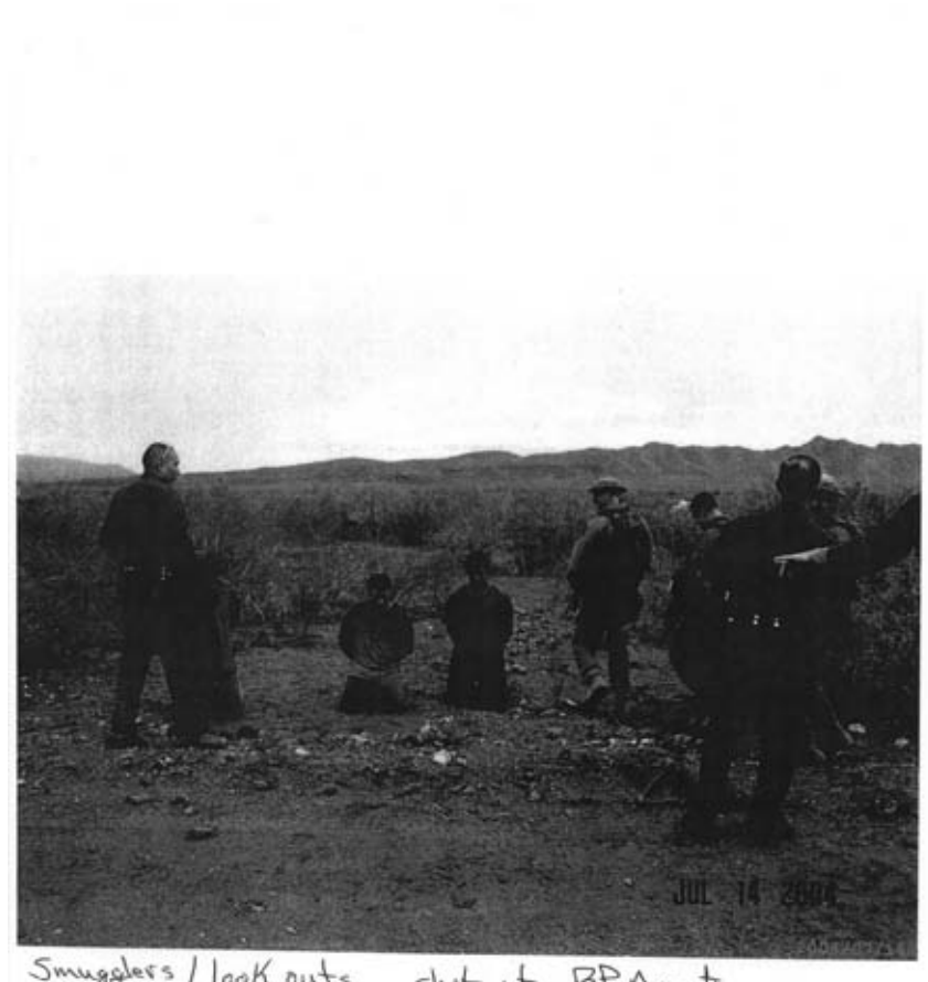
Smugglers/lookouts. shot at BP Agente 52 miles N of Border