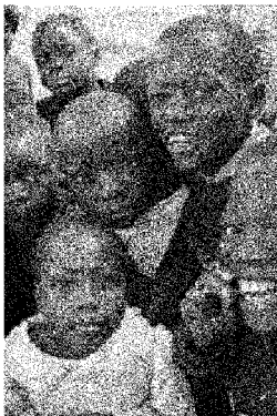
Children participate in Zambia's Africa KidsSAFE Alliance for Street Children Program

The Displaced Children & Orphans Fund dedicates resources to the needs of children living and working on the streets, the diverse factors that lead them to a life on the streets, and ways to foster their educational, social, and civic re-integration.