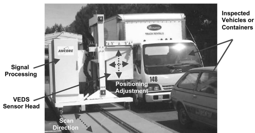
Figure 3. Portal Vehicular Explosive Detection System (VEDS).

Finally, our TNA-based Vehicular Explosive Detection System (VEDS) could be deployed here and in other ports to detect explosives in suspicious vans and trucks or for the detection of a “weaponized” cargo container full of explosives or chemical weapons. VEDS can detect all known explosives, including military, commercial, and home-made, while simultaneously detecting drugs.