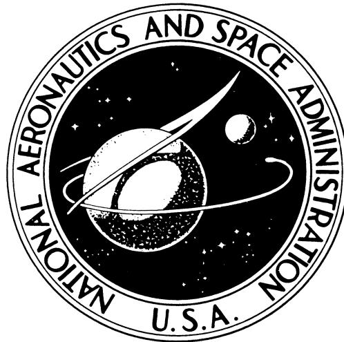
The NASA Seal