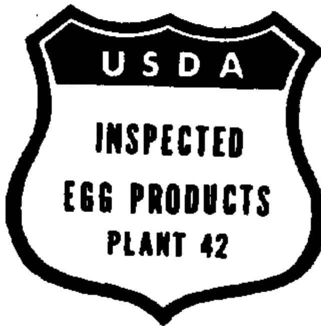
Figure 1 to § 590.413

word plant. The plant number may also be omitted from the official mark if applied on the container’s principal display panel or other prominent location and preceded by the letter “G.” 76