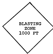
About 48" x 48"

(ii) Specimens of signs which would meet the requirements of paragraph (k)(3) of this section are the following: