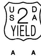
Figure 5 to paragraph (e). Official Yield Grade Identification Mark.

"5," as shown in Figure 5 to paragraph (e) of this section, constitutes a form of official identification under the regulations to show the yield grade under said standards. The identification letters assigned to the grader performing the service will appear underneath and outside of the shield.