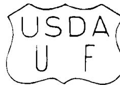
Figure 1 to Paragraph (a). Preliminary Grademark.

may also be used to determine the final quality grade of carcasses; one stamp equates to "USDA Select" or "USDA Good"; two stamps placed together vertically equates to "USDA Choice"; and three stamps placed together vertically equates to "USDA Prime."