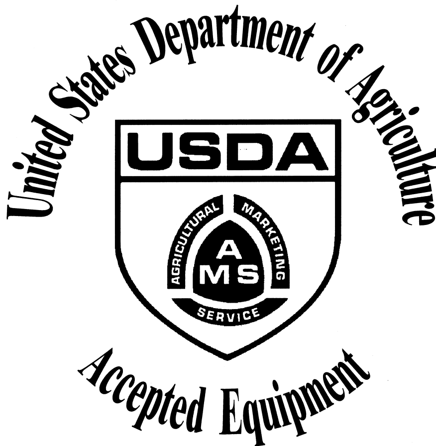
Figure 1. Official identification symbol.