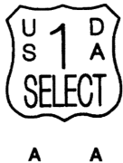
Figure 4 to paragraph (d). Official Combined Quality and Yield Grademark.

(d) For combined quality and yield grade identification purposes only, a shield enclosing the letters "US" on one side and "DA" on the other, with the appropriate yield grade designation number "1," "2," "3," "4," or "5," and with the appropriate quality grade designation of "Prime," "Choice," "Select," "Good," "Standard," "Commercial," "Utility," "Cutter," "Canner," or "Cull," as shown in Figure 4 to paragraph (d) of this section, constitutes a form of official identification under the regulations to show the quality and yield grade under said standards. The identification letters assigned to the grader performing the service will appear underneath and outside of the shield.