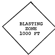
About 48" x 48"

(ii) Specimens of signs which would meet the requirements of paragraph (k)(3) of this section are the following: