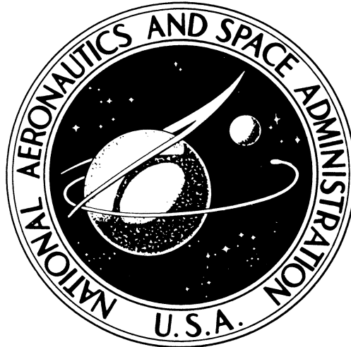
The NASA Seal