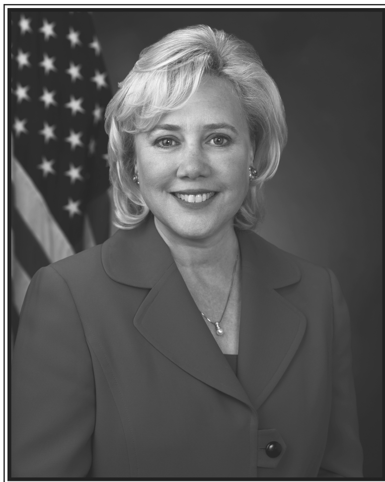
Mary L. Landrieu