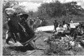
Cocaine traffickers had set fire to their aircraft shortly before being apprehended by law enforcement authorities in Honduras in August 2011.

JIATF South employs a “defense forward” strategy to detect, monitor, and interdict illicit trafficking events in the Western Hemisphere. The suspect aircraft pictured here was initially detected by Colombian ground-based radar, U.S. radar systems, and U.S. Air Force aircraft. JIATF South coordinated the launch of a Colombian Air Force jet, which visually identified and tracked the suspect aircraft into Honduras. JIATF South also coordinated the launch of a Honduran Air Force jet as well as the launch of two helicopters carrying DEA agents and a Honduran Tactical Response Team. When the suspect aircraft landed, the Colombian Air Force crew observed the traffickers as they transferred the contraband into trucks and then set fire to the empty aircraft. The helicopters followed the trucks until they stopped and then deployed the Honduran Tactical Response Team to interdict the load and apprehend the traffickers, resulting in the seizure of 470 kilograms of cocaine.