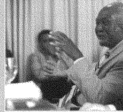
Congressman Danny Davis speaks at a roundtable discussion at Loyola University in Chicago. October 17, 2011.

To further advance criminal justice reform, ONDCP Director Gil Kerlikowske held a series of criminal justice policy roundtables focusing on the African American community during the fall of 2011 in Atlanta, Chicago, Los Angeles, New York, and Philadelphia. Director Kerlikowske co-hosted the listening sessions with Congressman John Lewis in Atlanta, Congressman Danny Davis in Chicago, Congresswoman Maxine Waters in Los Angeles, Congressman Ed Towns in New York, and Mayor Michael Nutter in Philadelphia to discuss the Obama Administration's evidence-based approach to reforming the criminal justice system and to hear suggestions on other necessary actions to reduce racial disparities. Attending each session were local African American leaders, judges and law enforcement officials, substance abuse prevention and treatment professionals, community members, and representatives from national African American organizations. Bringing together a broad swath of local leaders and community members who deal with these issues on a daily basis created an opportunity to discuss the current needs of the community and plan for future collaborative efforts. While each community identified its own specific needs, the roundtables also underscored the common understanding that reducing drug use and its consequences requires a balanced public health and safety approach.