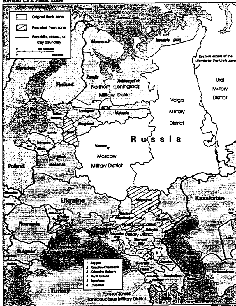
Revised CFE Flank Zone